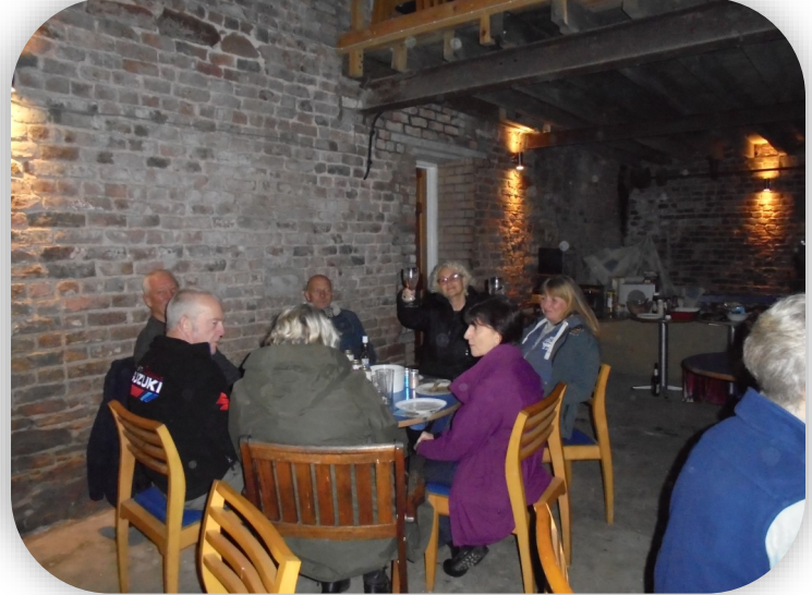
Bashers end of season BBQ